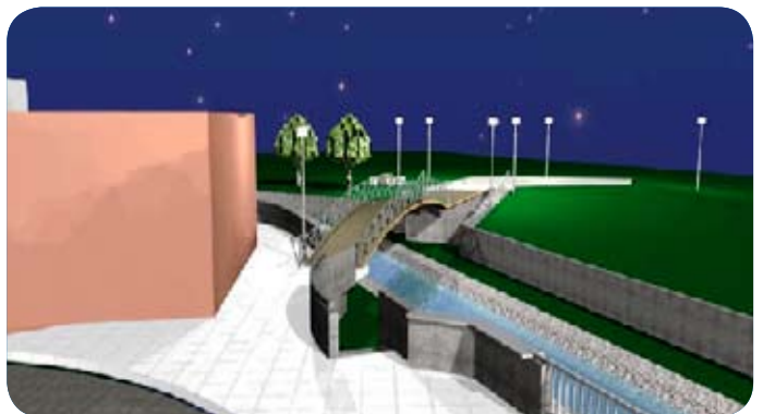
Figure 2: CIP Ferizaj/ Urosevac

These principles can be achieved through initiatives such as: