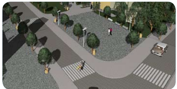
Figure 1: CIP Hani i Elezit/Gen Jankovic