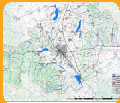
Flood vulnerability map of Ferizaj/Urosevac