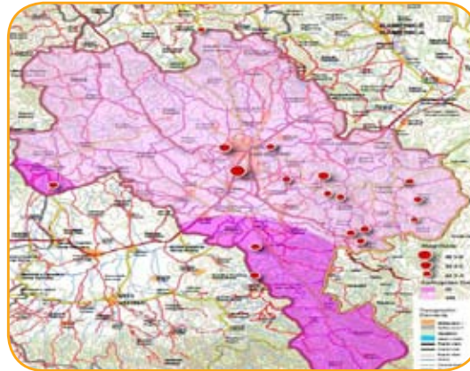
Earthquake vulnerability map of Gjiłan/Gnjilane

The process of preparation of DRAM component and of identifying a school for reinforcement has involved all concerned stakeholders. During this process a number of presentations/consultations were held and involved various stakeholders and civil society representatives. After its finalisation the DRAM component will be approved by the Municipal Assembly as an integral part of Municipal and Urban Development Plans.